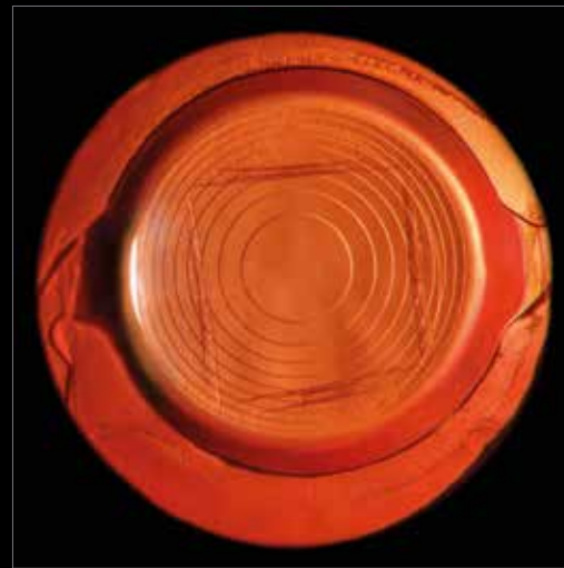
Capsulotomy, Ellex – Step 1: multifocal lens

Employing TCI™ to identify capsular fragments, Tango Reflex™ can be used to vaporize broken pieces of the fragment and help prevent the common problem of sudden post-capsular floaters post treatment.